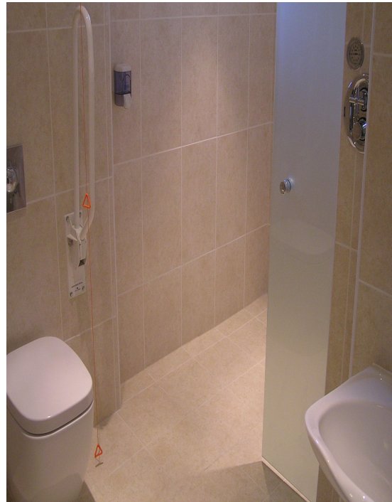
Radcliffe Gardens - After