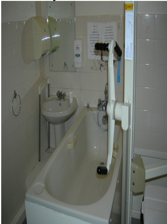
Halcyon Court - Before