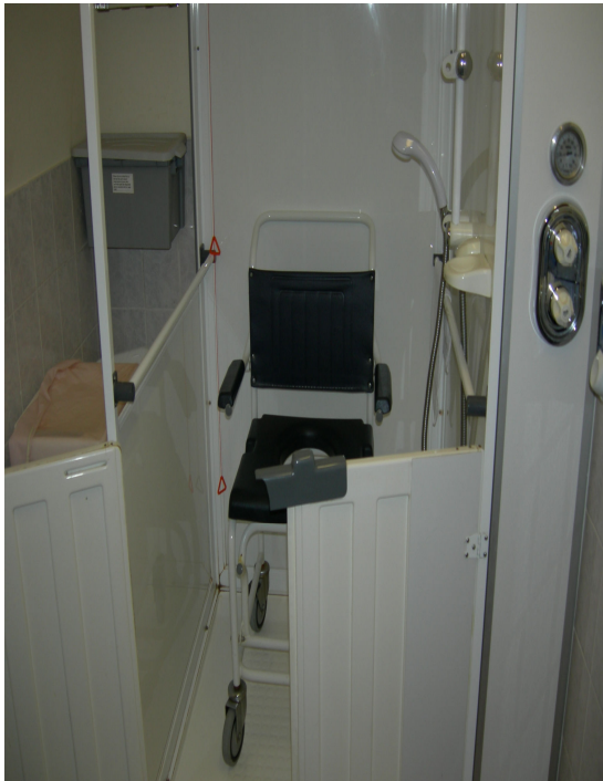
Radcliffe Gardens - Before