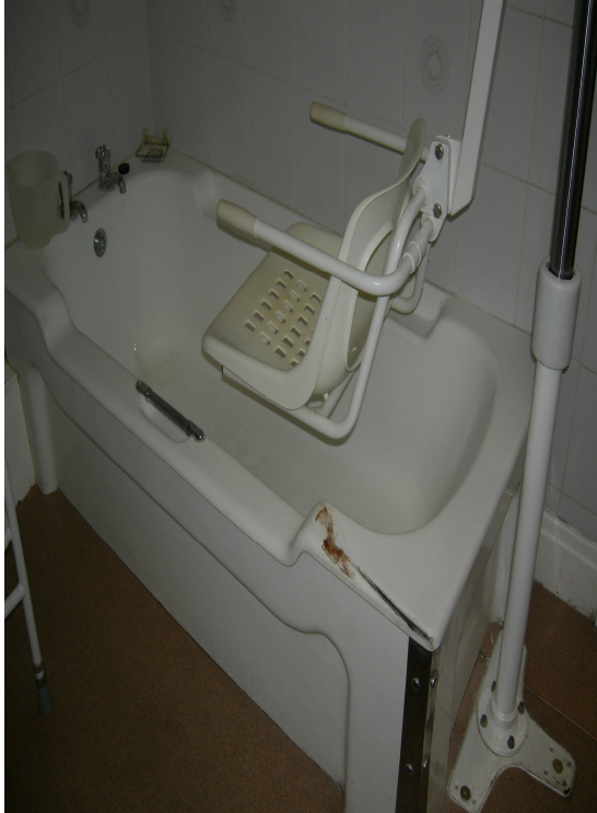
Vivian House - Before