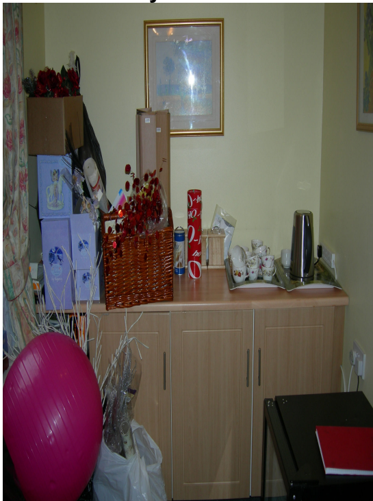
Sunnyside - Before